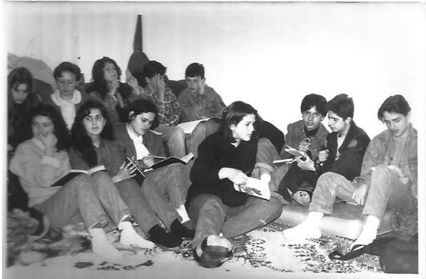
Xhevdet Doda students attended class in home-schools for a few months before teachers and students 'occupied' the decrepit building in central Prishtina. 1990 or -91.

Russia is dictatorial, it still wants to uphold the image that it is a democracy. A relatively safe form of non-cooperation is to boycott events, to simply stay away and refuse to participate.