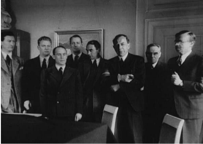
Members of the Danish Freedom Council after the Occupation.

In Denmark during WWII, the Freedom Council, which was coordinating the resistance movement, wrote in an internal report that strikes were causing more damage to the German war effort than riots and sabotage. This insight was written after an event in 1944 known as “the people’s strike”, when the resistance movement had been conducting sabotage for years. 20 However, this knowledge is almost unknown in Denmark, where the dominant narrative about the heroic sabotage still prevails. 21