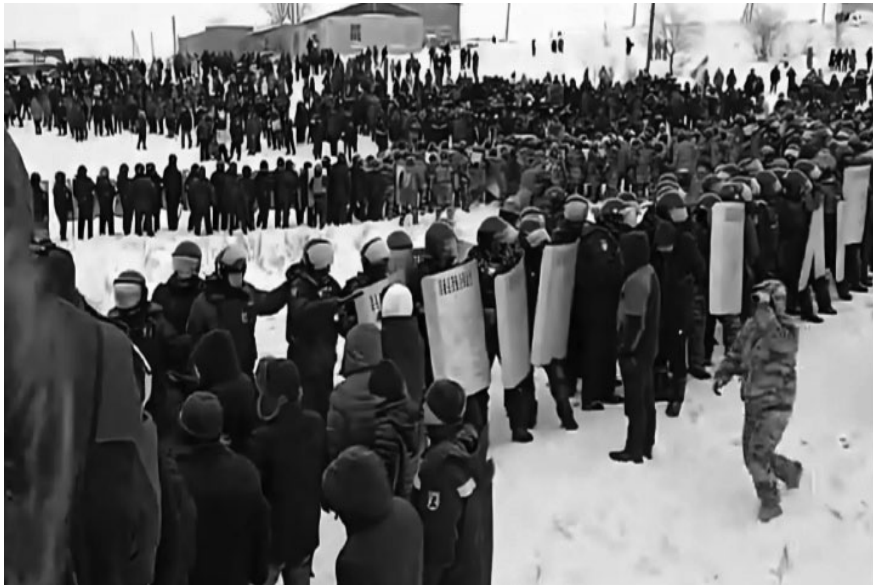
Protesters and police in Baymak, Russia. January 2024.