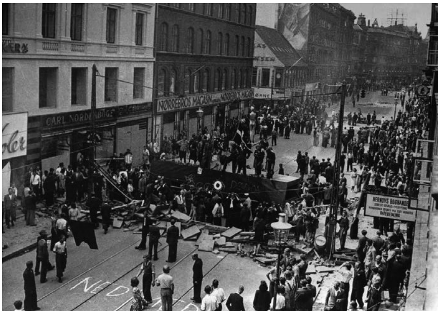
The people's strike in Copenhagen 1942.

Sabotage and riots might also play a role when it prevents the occupier from having the calm that they long for. It means that more personnel and other resources are tied up in maintaining the occupation, and cannot be used to fight a war on the frontline. I think we need to discuss such aspects much more among scholars of nonviolence. This requires an openminded evaluation of the role of sabotage and riots, considering both how they might support nonviolent actions, as well as what the price of sabotage and riots might be. Maybe the less risky adoption of nonviolent methods without sabotage and riots can be sufficient to disturb the calm and keep the fighting spirit high. I have already mentioned some options in relation to Ukraine, and this is something that could be studied more in historic cases.