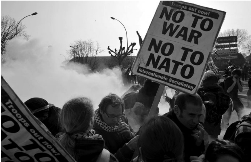
NATO protest Strasbourg.

The Sceptic: But Russia's attack on Ukraine proves exactly the opposite, that NATO is needed more than ever, to defend western countries from Russia!