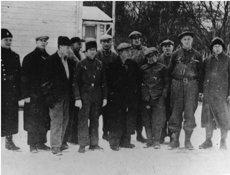
Teachers in prison camp in Kirkenes, Norway 1942.

German occupation administration interfered. They instructed the police to arrest 1100 male teachers, which was done across the country. Here one can speculate about why most of the Norwegian police were so obedient, and what would have happened if they had also refused to cooperate with the Nazis and neglected to arrest the teachers? But that would have been a different story. 1100 teachers did get arrested and eventually about half of them were sent to hard labour in the north of Norway. Along the way they were exposed to torture, and given inadequate food and shelter. Some