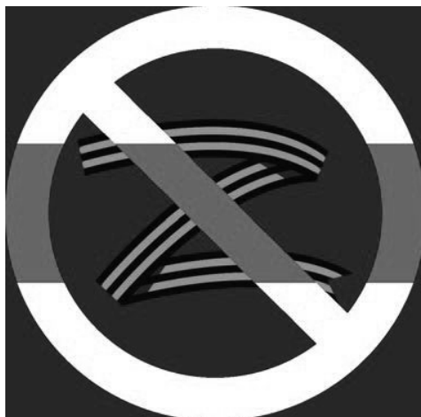
A symbol of protest against Putin's invasion of Ukraine.

to remove Putin from power and change the Russian population's attitude to what is happening in Ukraine. At the moment, authoritarian forces in Russia are being strengthened, and the longer the war continues, the more hostility there will be between Russia and Ukraine in the decades to come.