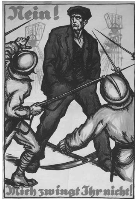
“No! You don’t force me!” Protest poster from Ruhr 1923.