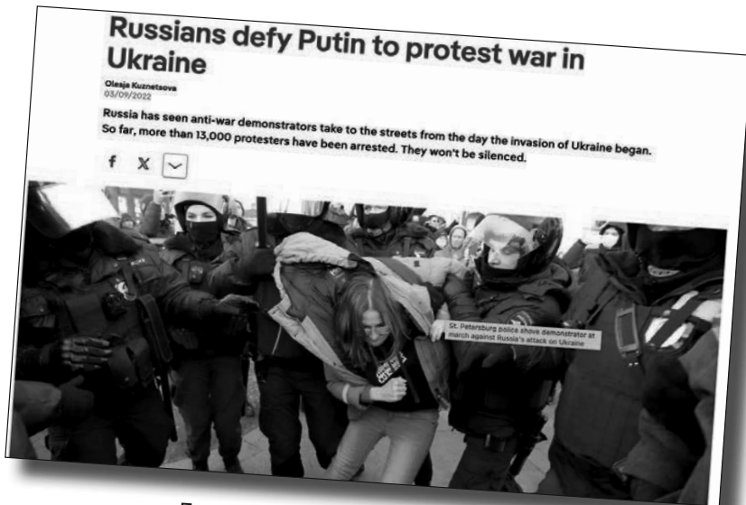
Faximile from DW 3 September 2022

really was the case: a country like Russia is armed to the teeth, surrounded by neighbouring countries without any military. How long do you think the population in Russia will accept a leader that spends billions arming against countries that cannot possibly be considered a threat? Even if Russia continued to be heavily armed and saw this as an opportunity to invade all its neighbours, how many resources do you think it would take to uphold an occupation of all of Europe against determined, well prepared and completely unruly populations?